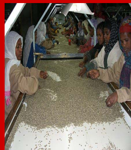
Women in Ethiopia sort through green coffee beans looking for defects.

The goal of Java Hope is to give economic empowerment to disenfranchised women. An unemployed, yet actively searching woman is given the opportunity to operate her own coffee cart. She is trained on all aspects of business, from start-up procedures, daily operations, purchasing and bookkeeping. After successful completion of the training, the woman is trained on acquiring funding for her company. Once completed, the cart is purchased and rightfully owned by the woman. She then becomes an asset to her community instead of a burden.